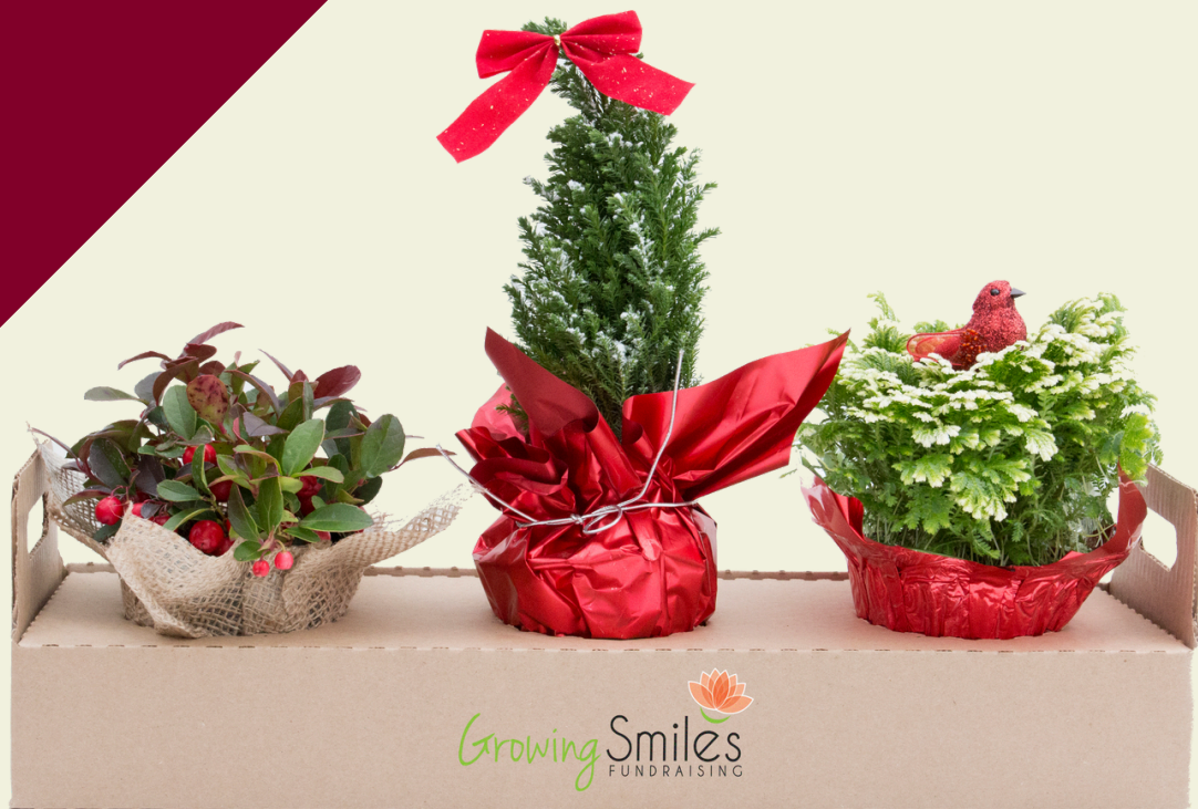
Table Top Trier