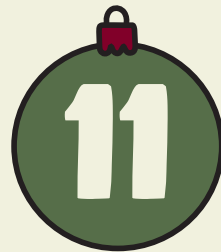
Table Top Trios